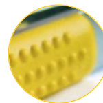
Tumour grasping forceps